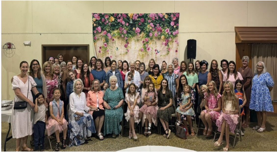
Great Turnout For Ladies' Banquet At Buford Grove Baptist Church On Friday Evening