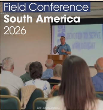
BIMI Field Conference