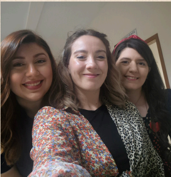
Re-connecting with dear missionary friends!